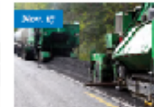
Nov 12 Asphalt Recycling and Reclaiming Association (ARRA)