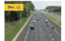
Dec 15 International Heavy Hauling Association (IHHA): Design and Inspection Manual