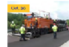
Oct 26 Webinars: What is it good for?