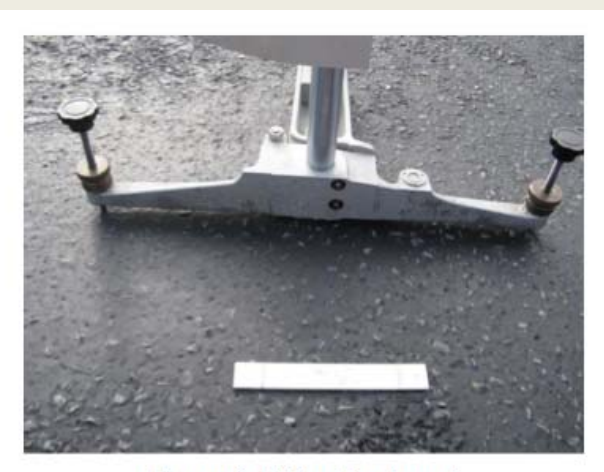
Figure 2. Before treatment